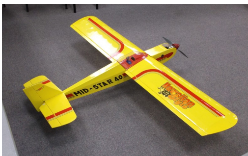
Dan Placido's Mid-Star 40 built from a Sig Kit and covered with Ultra Coat . Great Job Dan !!