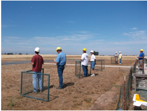
T-34 racers in action . It looks calm but it is more intense than it looks